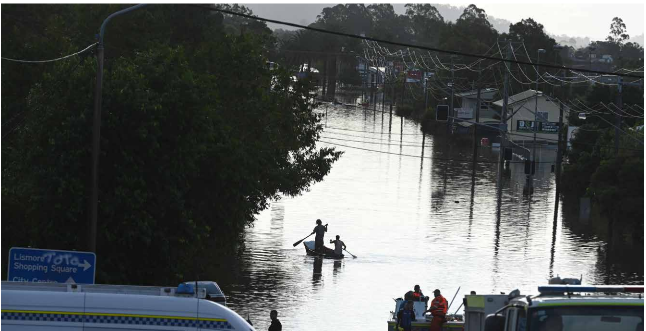
Image 1: People canoeing down a flooded street in Lismore during the floods in February 2022.