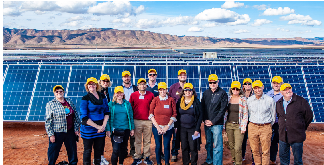
Image: CPP members at Bungala Solar Farm.

Collectively members have pledged to take over 710 actions that support climate change solutions, 48% of members have a Renewable Energy Target and 33% have a Net-Zero Emissions Target.