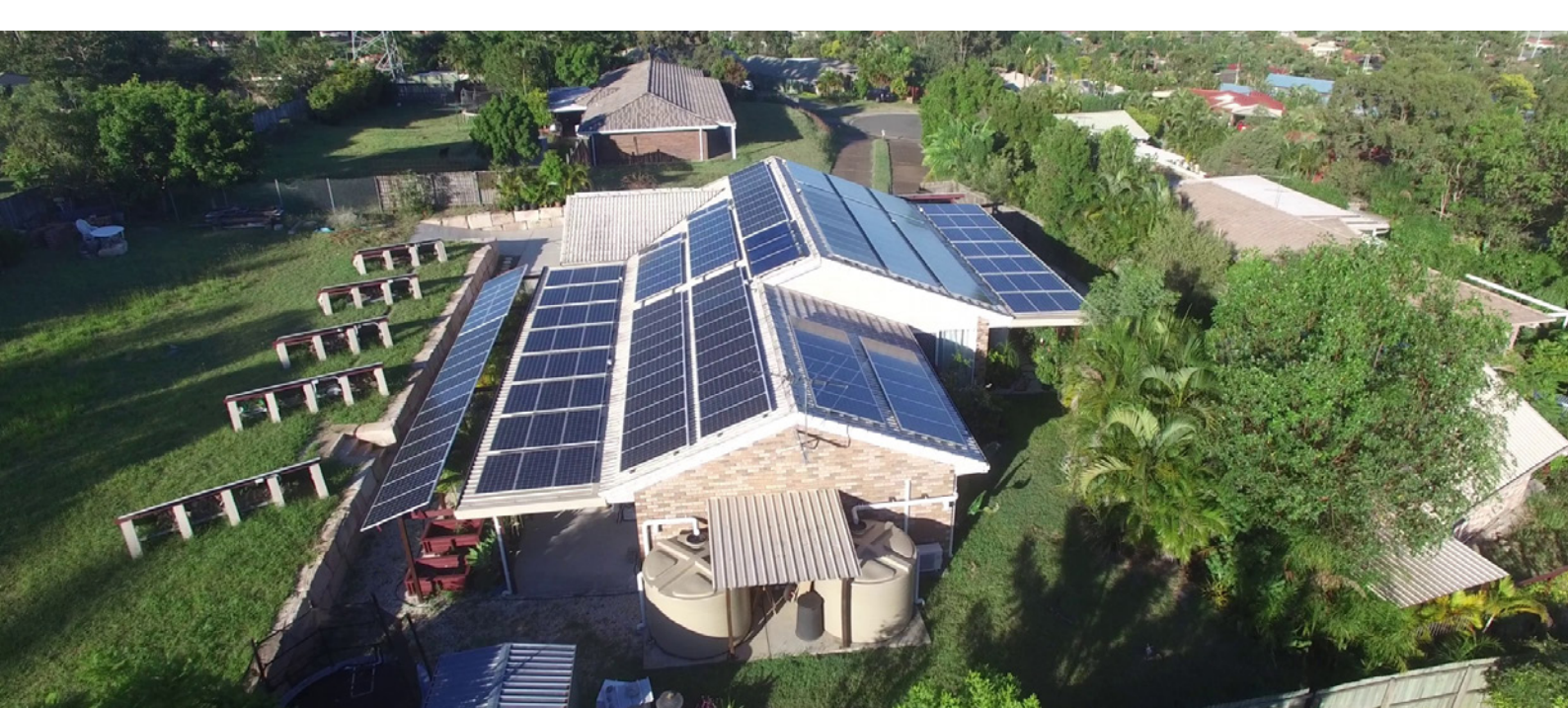
Figure 3: Queensland leads the nation in the proportion of households with rooftop solar.