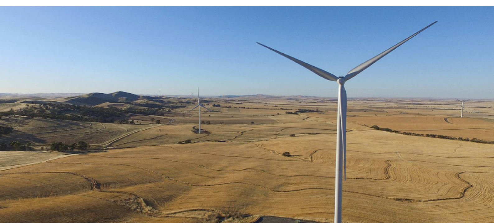
Figure 6: The three stages of the Hornsdale Wind Farm in South Australia (below) put forward winning bids under the ACT's reverse auction process. Stages 2 and 3 of the project set record low prices for wind energy in Australia at the time.

'Territory Trailblazer: How the ACT became the renewable capital of Australia'.