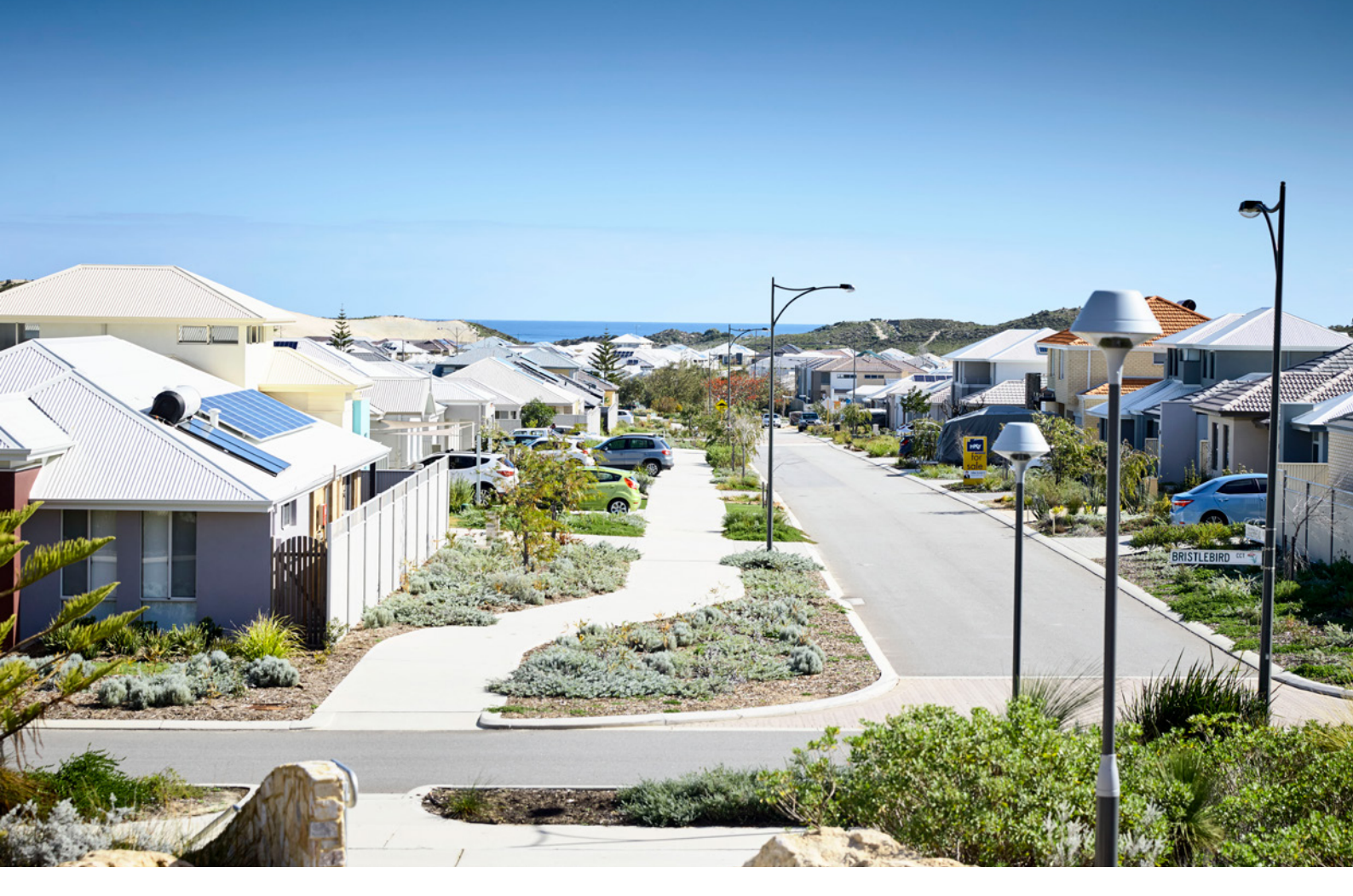
Figure 4: Homes in the Alkimos Beach residential development in Western Australia have rooftop solar.