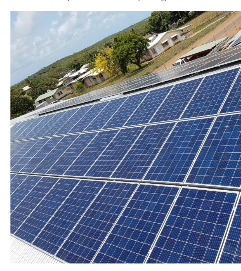
Figure 10: 750 solar panels have been installed in Lockhart River (below) to help reduce the community's energy bills.

Queensland continues to lead Australia in rooftop solar. Almost one third of households (32.9%) have now installed solar PV, more than any other state or territory (APVI 2018). The Queensland Government has also installed solar in the remote community of Lockhart River in far north Queensland. 750 solar panels have been installed on the roofs of government buildings, such as schools, and the electricity produced by these panels can be used by the whole community. Solar can provide about 10% of the community's energy needs, helping to reduce Lockhart River's reliance on expensive and polluting diesel (Queensland Government 2018b).