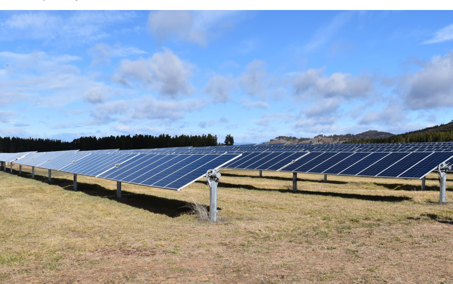
Figure 2: The Mount Majura solar farm, which opened in 2016, was supported by the ACT Government with a power purchase agreement.

While Queensland has just 377MW of wind and solar capacity (and lags behind the other states in terms of capacity per capita), this number is expected to increase significantly over the next few years as the state has over 3,000MW of wind and solar projects under construction (Clean Energy Council 2018a).