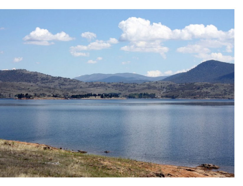
Figure 14: Lake Jindabyne is part of the Snowy Mountains Hydroelectricity Scheme. The Federal Government's Snowy 2.0 pumped hydro project would significantly increase the amount of pumped hydro storage.

The Federal Government's abandoned National Energy Guarantee proposal, planned to reduce emissions from the National Electricity Market by just 2% between 2021 and 2030. This target is woefully inadequate. Australia would not meet its commitment to reduce emissions in line with keeping global temperature rise to under 2°C if a 26% emissions reduction target by 2030 is applied to the electricity sector (COAG Energy Council 2018).