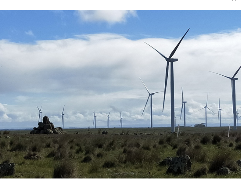
Figure 9: The Mount Gellibrand wind farm in Victoria, completed in 2018. The wind farm was supported by a 2015 Victorian Government tender for 100MW of renewable energy.

Victoria 2018a). The project will be complete in 2019 and provide clean, affordable and reliable power 24/7.