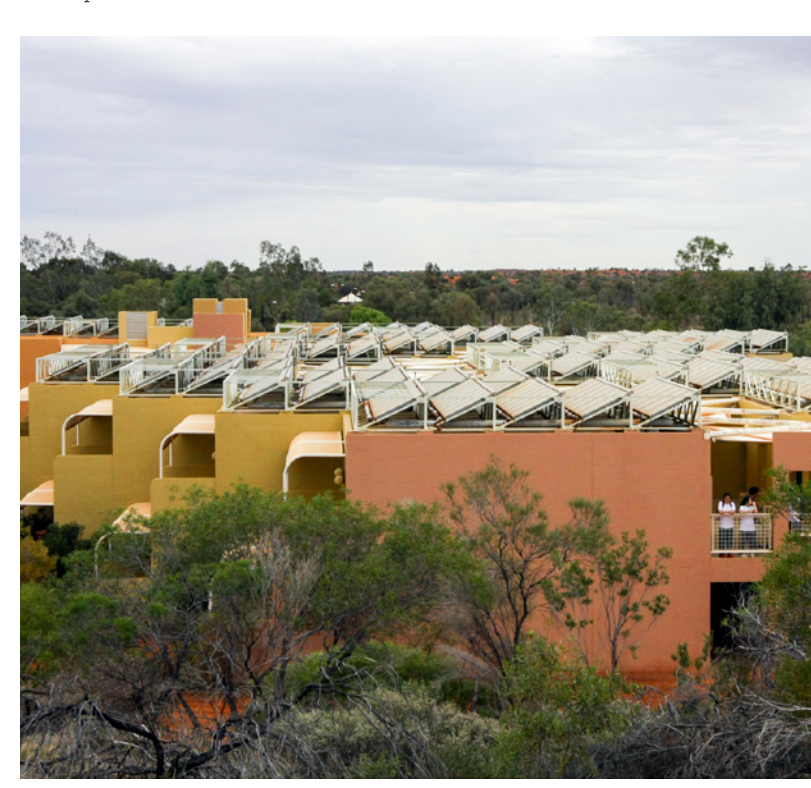
Figure 12: Solar panels on a hotel roof near Uluru, Northern Territory. 13.8% of households in the Territory have installed rooftop solar.

Three new solar farms and a grid-scale battery are being built to power airports in the Northern Territory. This includes a 40MW solar farm at the Darwin International Airport, a 10MW solar farm at the Alice Springs Airport and another solar farm at Tennant Creek (One Step Off the Grid 2018). A battery will also be built outside Darwin. These projects will significantly expand the amount of solar at the Darwin and Alice Springs airports which already have smaller solar systems. These projects are co-funded by the Northern Australia Infrastructure Fund (NAIF) (One Step Off the Grid 2018).