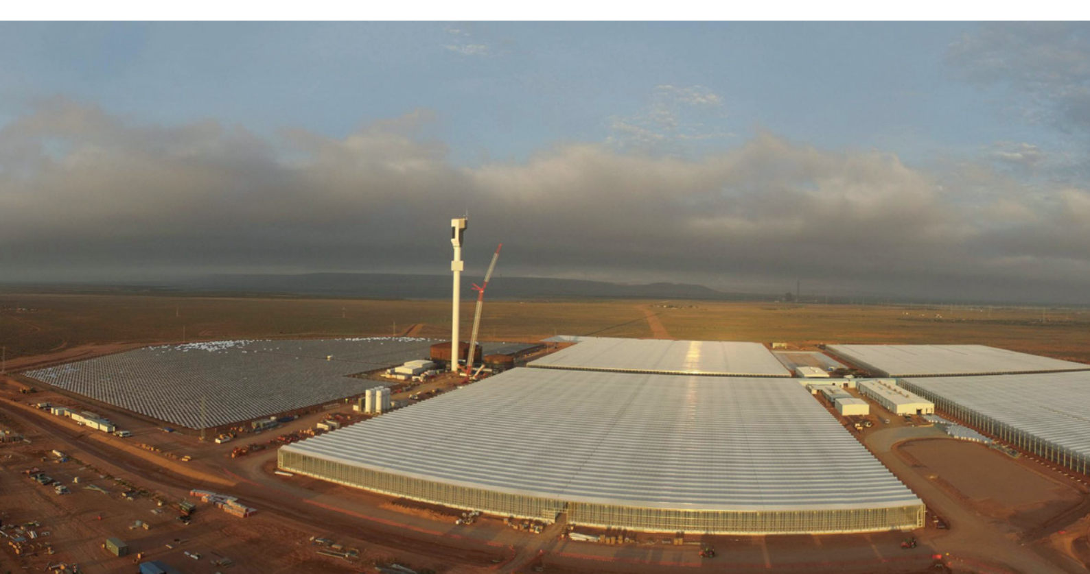
Figure 8: This solar thermal plant provides around 90% of the electricity needs of tomato growers Sundrop Farms in Port Augusta, South Australia.

The state government is continuing with the previous government's program to create a virtual power plant, with one hundred 13.5kWh batteries rolled out at low income Housing SA homes (Government of South Australia 2018b). Another 1,000 homes will soon follow, with the potential to scale up the program to 50,000 Housing SA and low income homes (Government of South Australia 2018b). The virtual power plant's solar and battery storage systems will be owned by an electricity retailer and controlled by the same software. This enables the generation, charge and discharge of energy to be coordinated, so that all the systems effectively operate as one power station - hence the name, "virtual power plant".