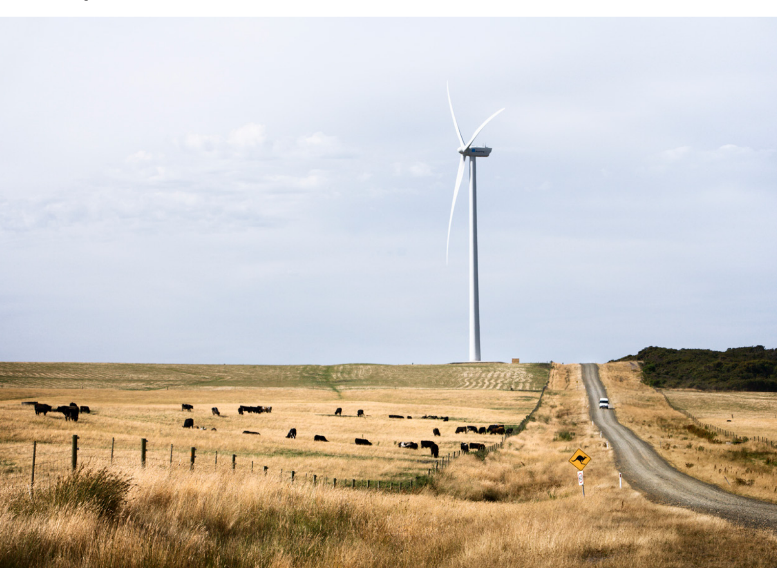
Figure 7: Tasmania's Woolnorth Wind Farm.

Tasmania became the first state to achieve net zero emissions in 2015-16. The state's emissions in 2015-16 had declined 100% from 1989-90, largely due to the state's extensive forests that act as a carbon sink for emissions in other sectors (Premier of Tasmania 2018). However, achieving net zero emissions through land-based measures can be risky and potentially short-lived, because carbon stored on land is vulnerable to being returned to the atmosphere, for example, through bushfires, insect plagues and changes in land clearing policies. Tasmania has a net zero emissions target for 2050.