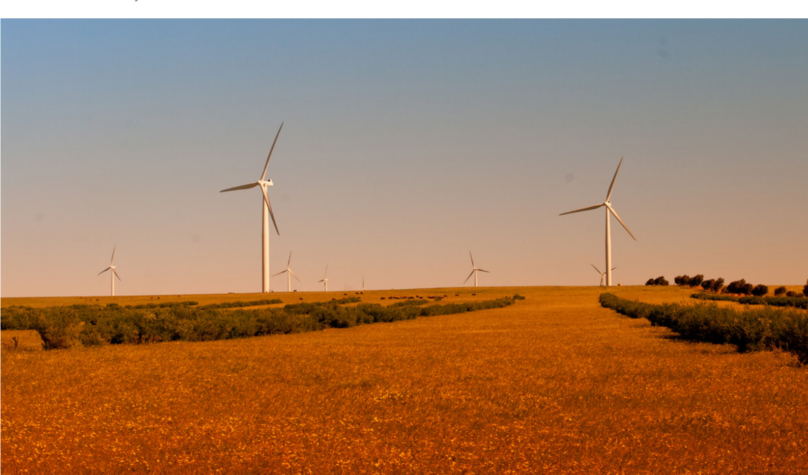
Figure 13: The Emu Downs wind farm in Western Australia is co-located with the a 20MW solar farm that was completed earlier this year.

In 2017, the state government brought forward the closure of Western Australia's oldest and dirtiest coal power station, the Muja AB power station, after an expensive ($300 million), failed attempt at refurbishing the 53 year-old power station (The West Australian 2017; Box 5).