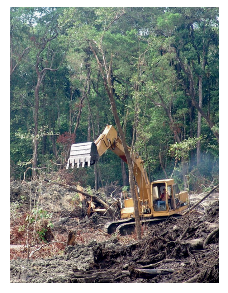
Figure 2: Recent vegetation clearing in Queensland.

In 2004 the Act was extended to leasehold land and extra regulations were introduced to end broad scale clearing of remnant vegetation for agricultural purposes. These changes came into effect in 2006, leading to a temporary increase in clearing prior to their introduction (between 2004 and 2006) due once again to "panic clearing." In 2009 the Act was again strengthened with extra protection afforded to high-value regrowth vegetation. The bans on broad scale clearing in 2006 and regulation of high-value regrowth in 2009 were likely major factors in driving the sharp decline in vegetation clearing from 2006 to the 2009-2011 period.