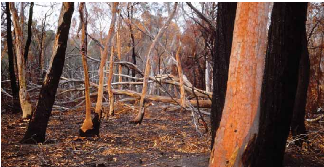
Figure 4: burnt trees, Black Mountain Canberra.

Animals are also affected by bushfires. For example if they are restricted to localised habitats and cannot move quickly, and/or reproduce slowly, they may be at risk from intense large-scale fires that occur at short intervals (Yates et al. 2008). Bushfires also disturb aquatic ecosystems; the 2003 bushfires affected communities of benthic aquatic algae and macroinvertebrates in the Cotter and Goodradigbee Rivers by destroying their aquatic habitat (Peat et al. 2005).