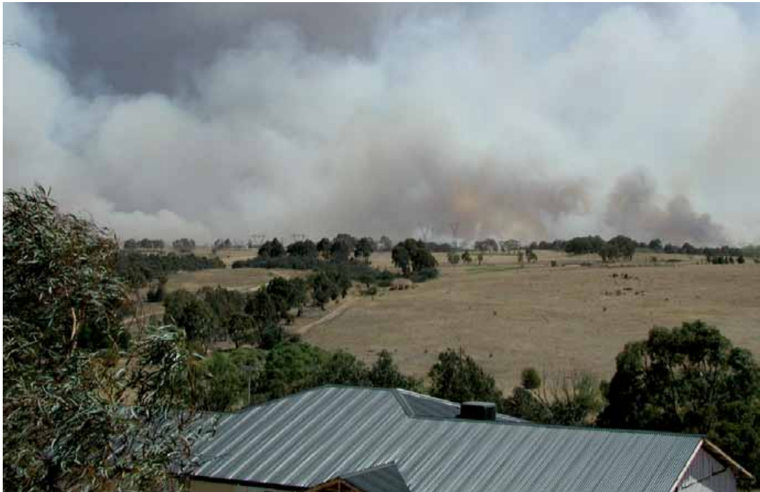
Figure 3: The 2003 Canberra bushfires spread in Dunlop