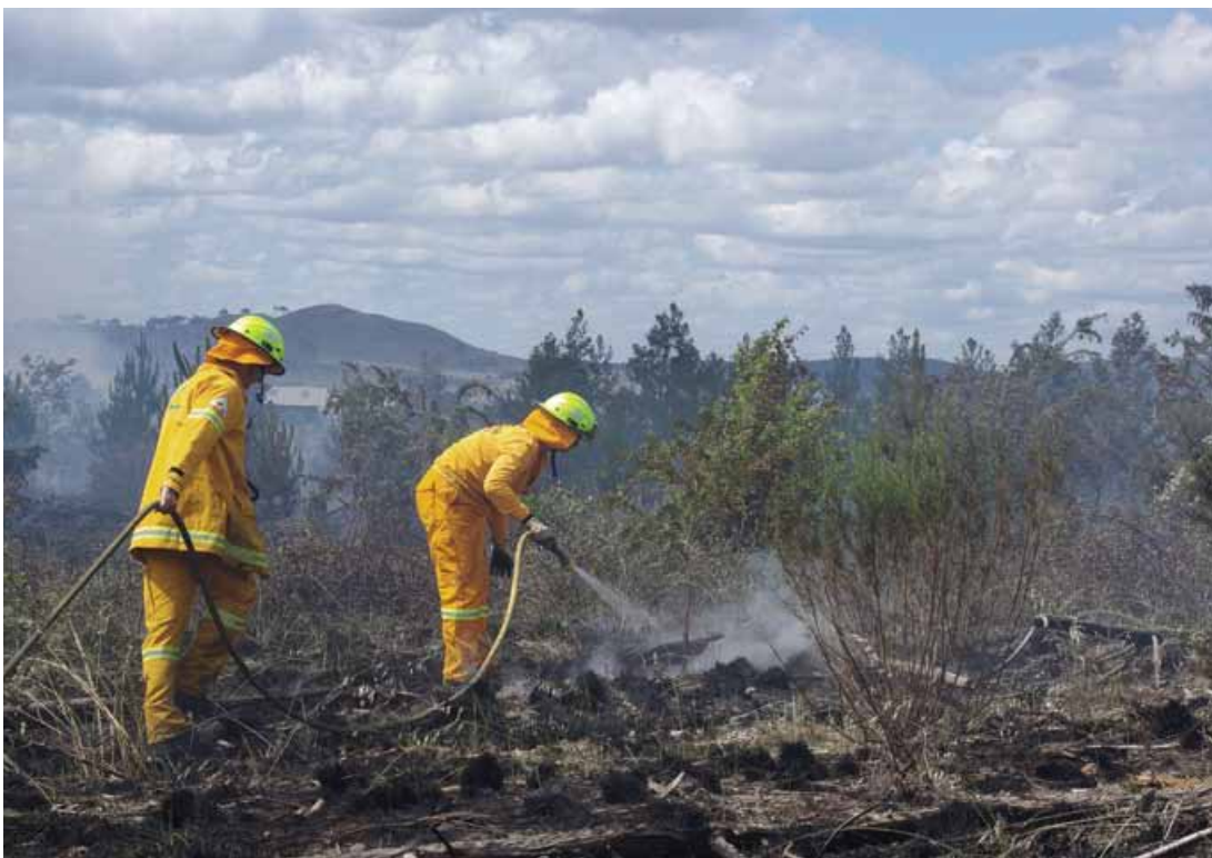
Figure 5: Firefighters conducting a hazard reduction burn in Canberra

Australia's premier fire and emergency services agencies have recognised the implications of climate change for bushfire risk and fire-fighting resources for some time.