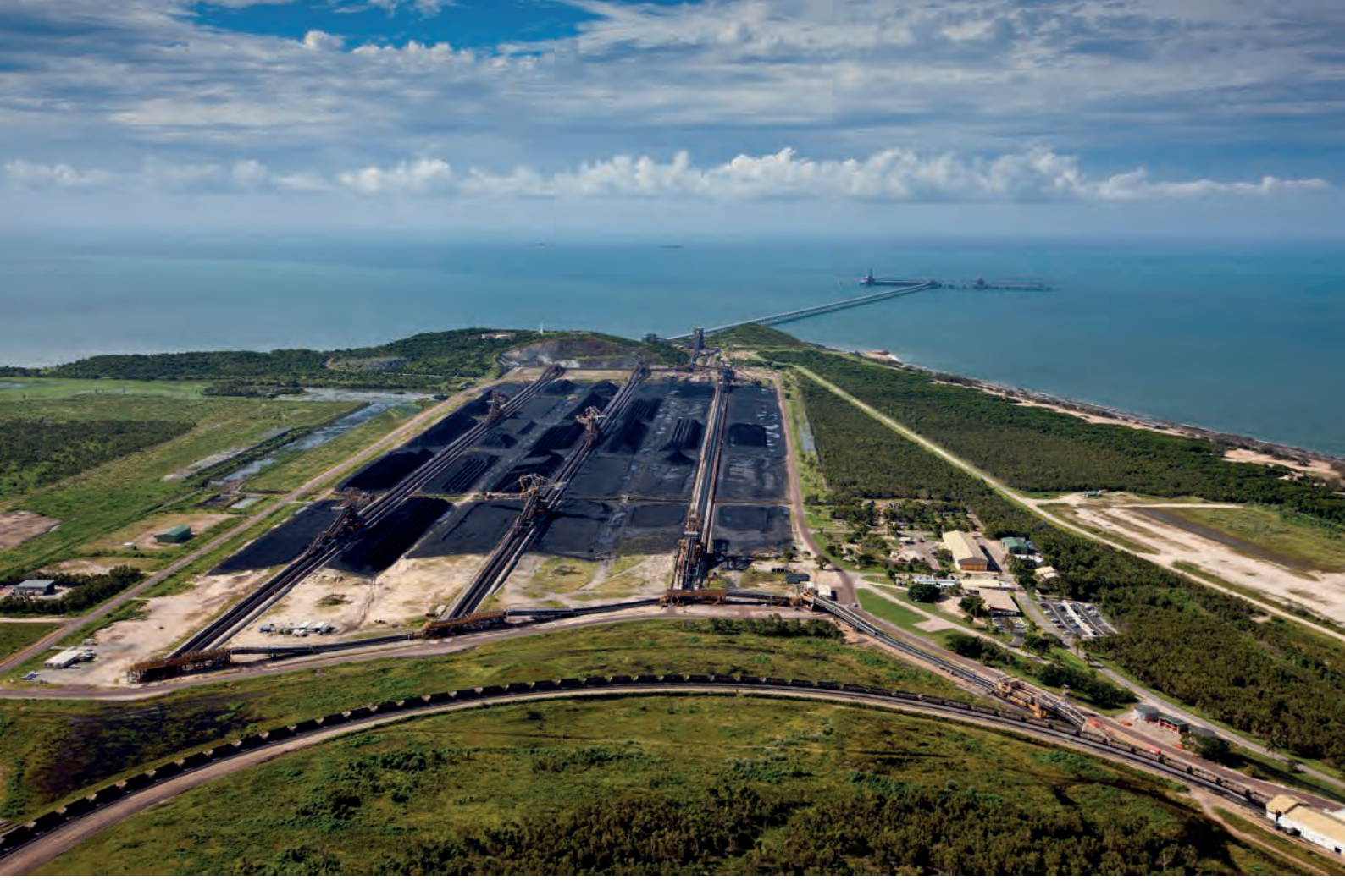
Figure 15: Abbot Point Coal Terminal in Gladstone, surrounded by wetlands and coral reef. This may become one of the world's largest coal ports if the coal terminal expansion goes ahead.

regions in the poorest areas of India. Coal also causes early death and reduces work productivity, therefore contributing to the maintenance of poverty. Death and ill health from air pollution can be substantially lowered with emission reductions of major sources of pollution.