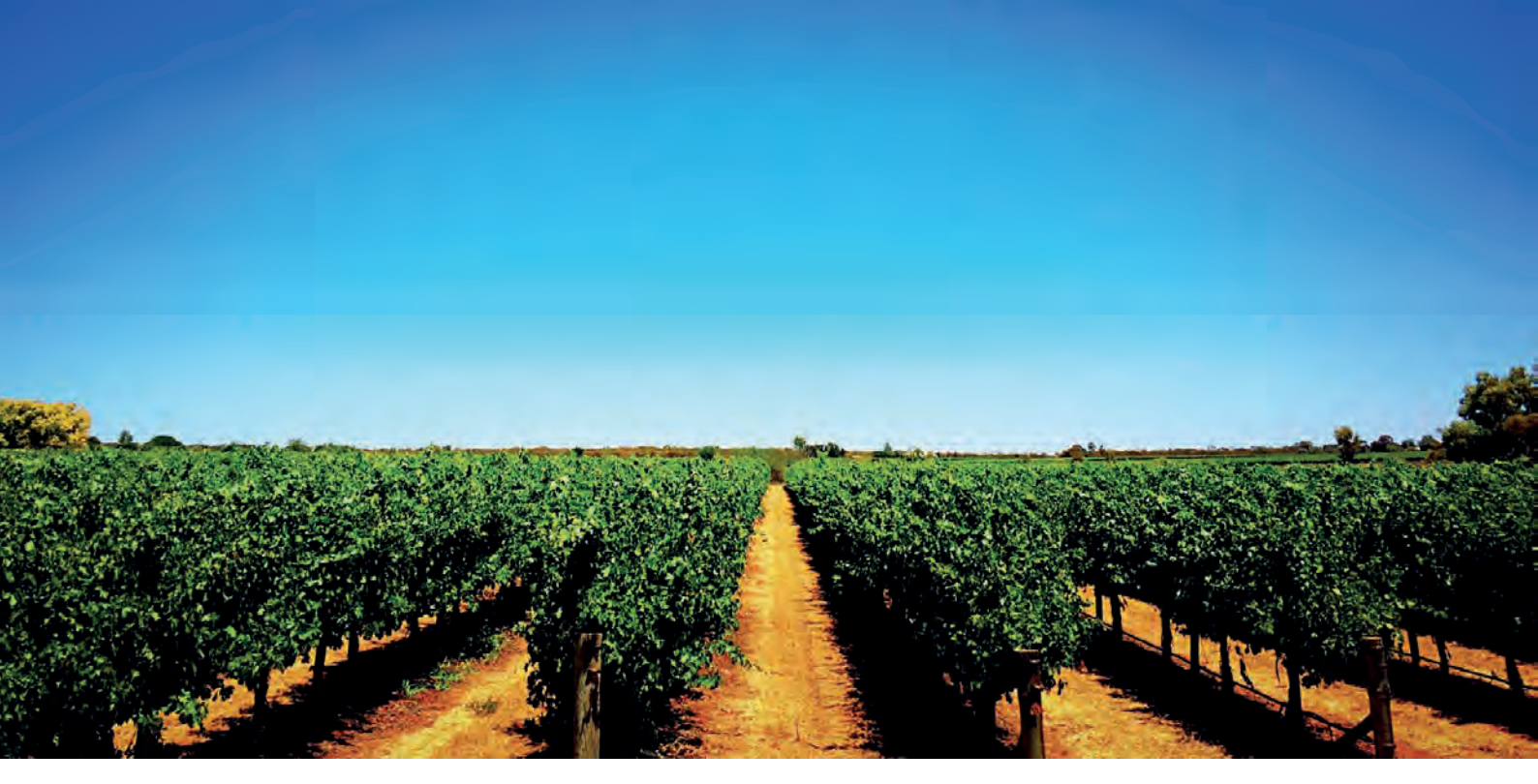
Figure 11: Australia's wine industry contributes significantly to the Australia economy, but viticulture is highly sensitive to changes in the climate.

Because 90% of groundwater extraction is used in agriculture (Tan et al. 2015), one of the major areas of contention between farming and mining is the impact on aquifers (Lawrence et al. 2013; Tan et al. 2015). Community concerns have resulted in Federal and State governments agreeing to tighten regulations that protect aquifers and limit pollution (Lawrence et al. 2013).