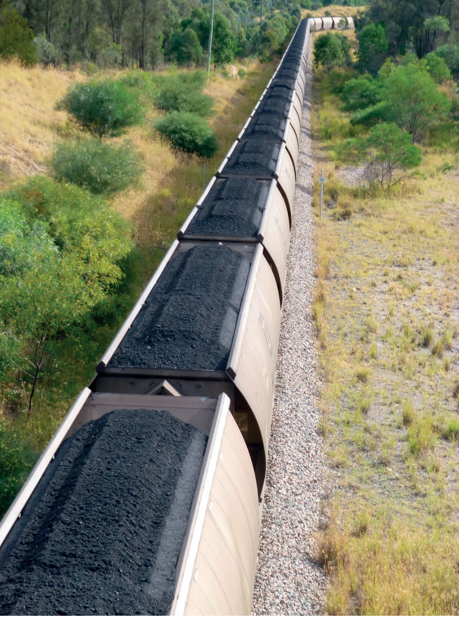
Figure 14: Uncovered coal train wagons in the Hunter Valley, New South Wales.