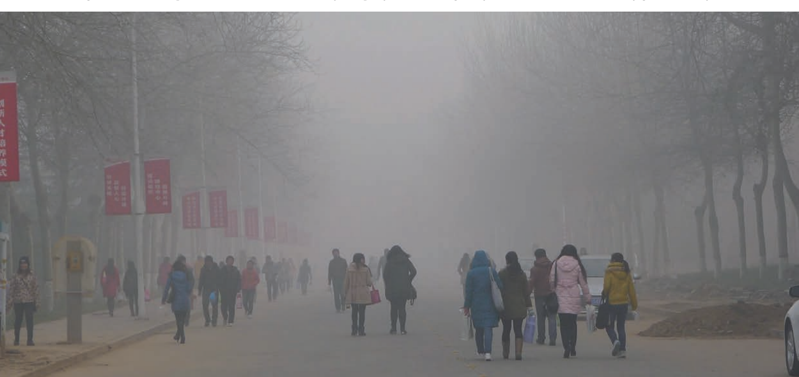
Figure 5: Dense air pollution in China. The country is rapidly transitioning away from a coal-based electricity generation system.