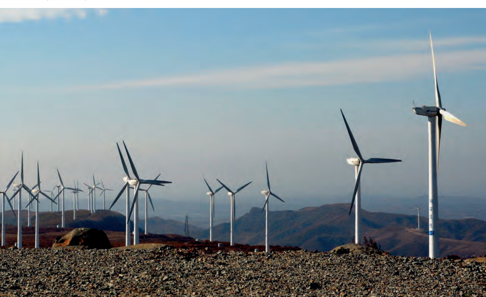
Figure 7: Mulan Wind Farm near Harbin City. China accounts for over a third of global investment in clean energy (REN21 2015).