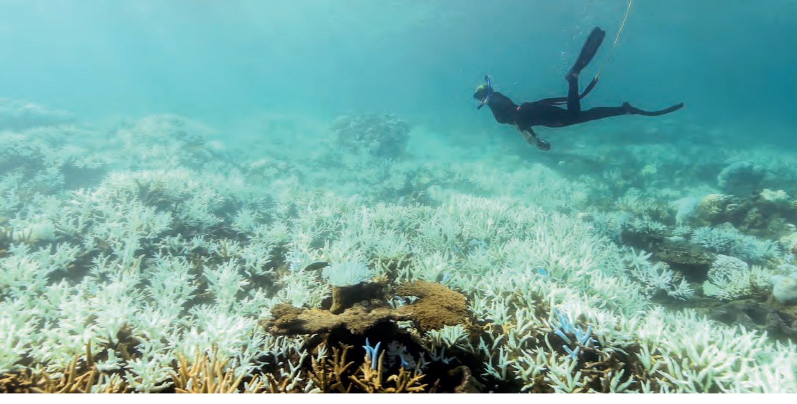
Figure 12: Bleached coral (white) and dead coral covered in algae (brown) at Port Douglas, on the Great Barrier Reef in March 2017.