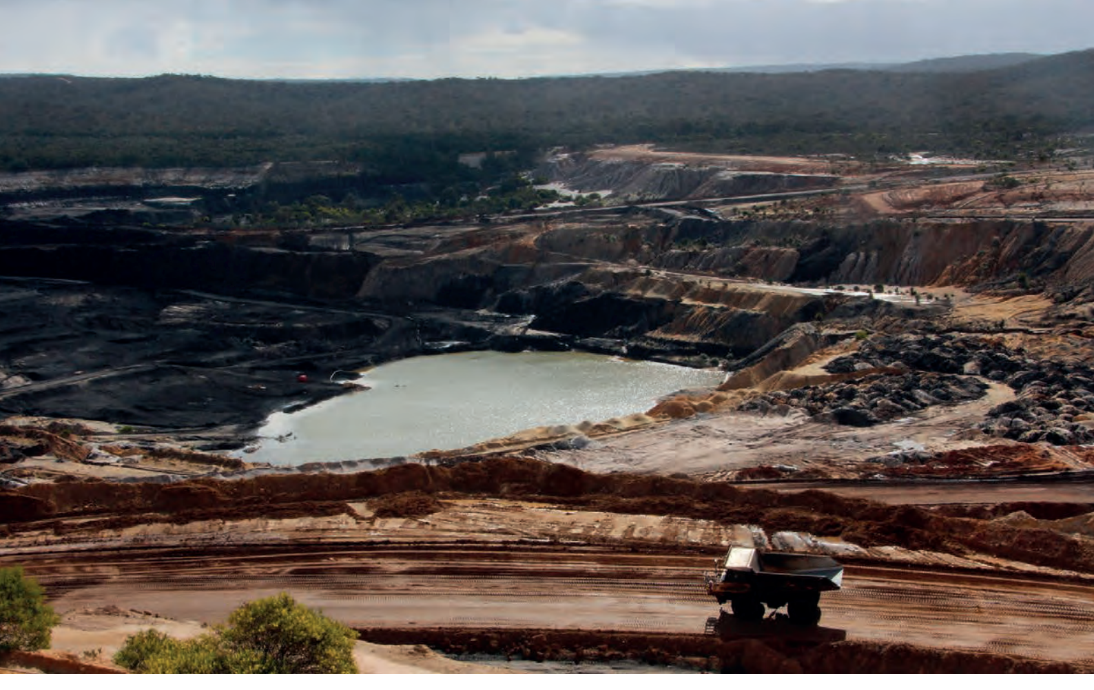
Figure 9: Stranded asset. Anglesea coalmine in Victoria closed in 2016 after the coal plant owner Alcoa was unable to find a buyer for the power station (RenewEconomy 2015).

Recognising the risk of stranded assets as the world transitions to a low carbon economy, investors are moving away from putting money in fossil fuel assets, that is, they are 'divesting' (OECD 2015). It is estimated that investors engaged in divestment managed a total of US$50 billion in assets in 2014 and by early 2015 this figure grew to US$2.6 trillion (Arabella Advisors 2015). By December 2016, it is estimated that the value of assets of institutions and individuals committing to divestment from fossil fuel companies was US$5 trillion (Figure 10). One year on from the Paris climate agreement, 688 institutions and 58,399 individuals across 76 countries have committed to divest from fossil fuel companies, doubling the value of divested assets represented in just over a year (September 2015 - December 2016; Figure 10). Pension funds and insurance companies now represent the largest sectors committing to divestment, indicative of the growing financial risks of having fossil fuel investments in a world committed to staying below 2°C global temperature rise (Arabella Advisors 2016).