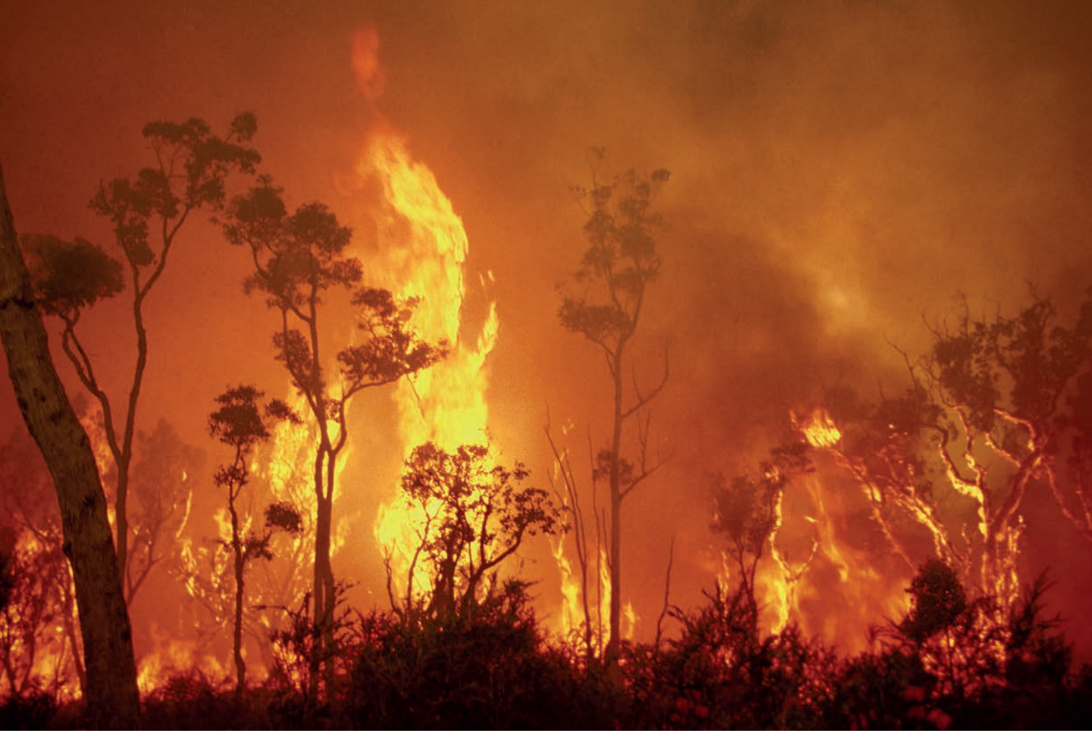
Figure 1: Bushfire risk is increasing in Australia as a result of climate change (Clark et al. 2013).

Given that it has taken significant time to ramp up action on climate change globally, there is now only a relatively small "carbon budget" left. The carbon budget approach allows us to quantify the amount of fossil fuels that can be burned to have a good chance of remaining under a 2°C rise in global temperature, the upper warming limit agreed to in Paris in 2015. More than 140 governments around the world, including Australia, have already ratified the Paris Agreement. Anything more than 2°C warming is considered too dangerous for humanity, not only for unacceptably large increases in direct impacts such as extreme weather events, but also for crossing climate 'tipping points', where large, rapid and