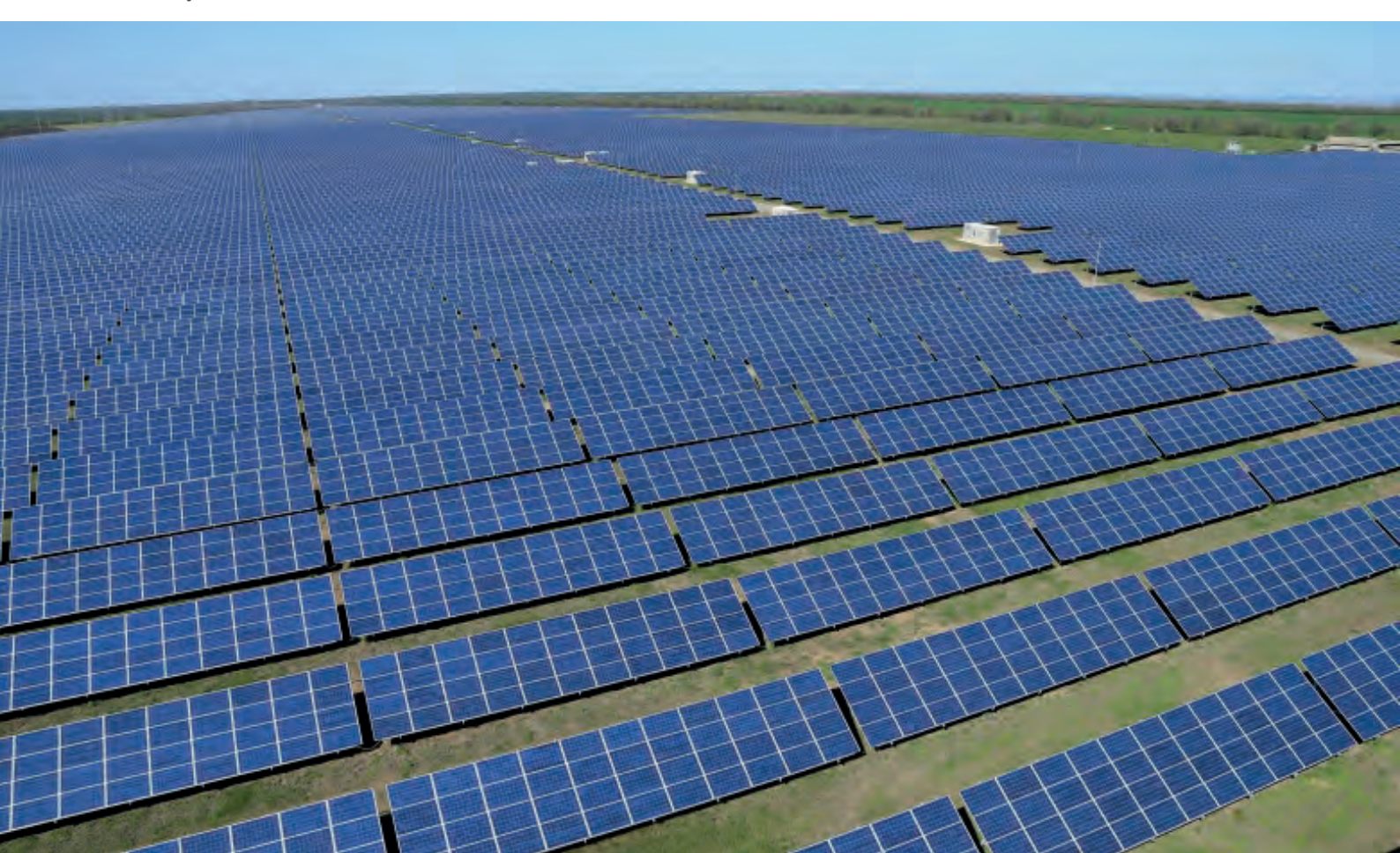
Figure 6: A large-scale solar farm (43MW) in southeastern Europe. More solar PV was added globally in 2016 than in any other year.