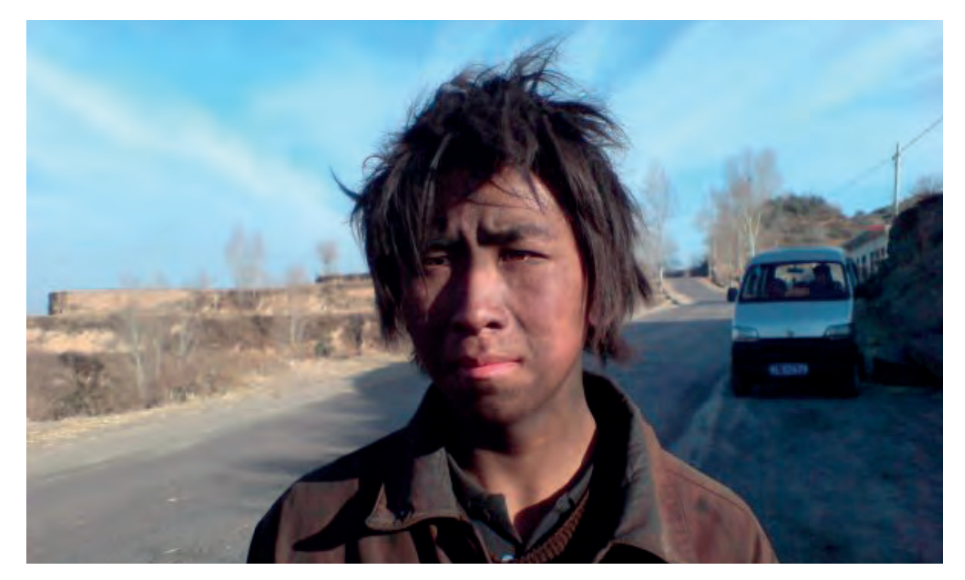
Figure 13: A young coalminer in China. Miners, workers and local communities can suffer serious health consequences from coalmining (e.g. Castleden et al 2011).