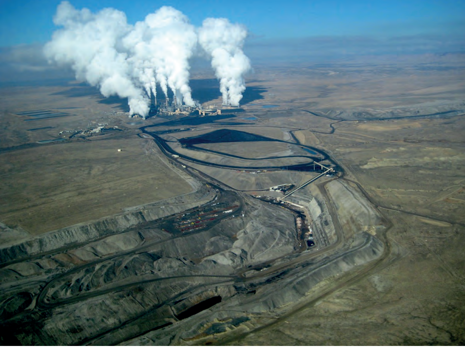
Figure 2: San Juan generating station and coalmine in New Mexico. The more CO_2 emitted into the atmosphere, the more the Earth warms.

There is a direct relationship between our emissions of CO<sub>2</sub>, primarily from the burning of fossil fuels (Figure 2), and the rise in global average temperature (IPCC 2013). The more CO<sub>2</sub> we emit, the more the Earth warms. So, to limit warming to no more than 2°C, there is a limit to how much CO<sub>2</sub> we can emit. That is, there is a global carbon budget for the amount of fossil fuels we can burn. The global carbon budget provides a framework for understanding how much fossil fuels we can burn to have a good chance of staying below a 2°C rise in global temperature. While no amount of global warming is entirely 'safe', the budget approach can assist in planning the speed and scale of the transition away from fossil fuels.