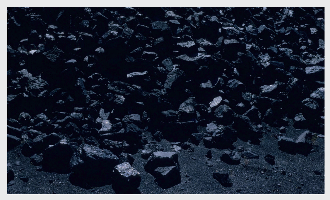
Figure 4: Coal is never "clean"; it pollutes the environment and damages our health.

For very clear and commercial reasons, major Australian energy companies have ruled out building new coal plants. The Australian Energy Council sees them as "uninvestable". Consistent with APRA's February 2017 Climate Risk position, banks and investment funds are not interested (APRA 2017). Any new coal plants would be much more expensive than renewables and carry a huge liability through the carbon emissions they produce (see Section 3).