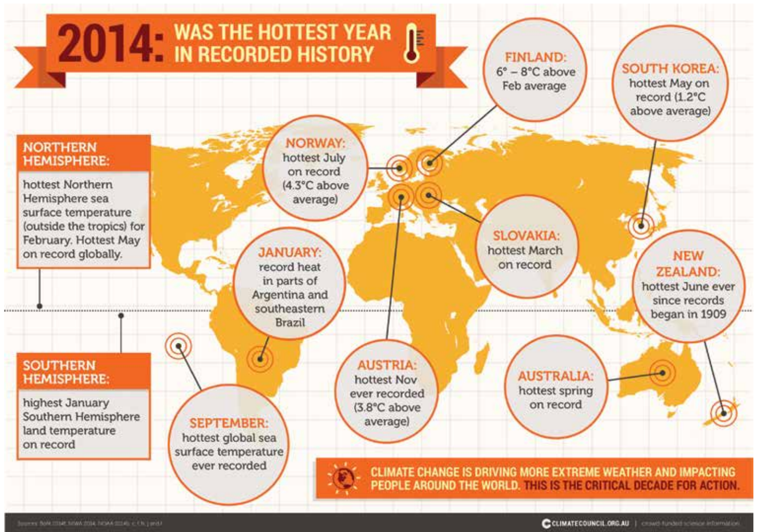
Figure 2: Major Heat Records in 2014