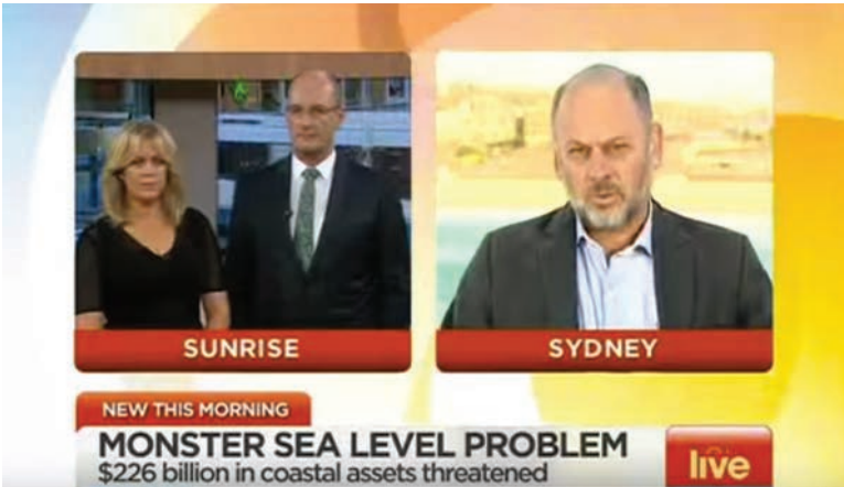
Professor Tim Flannery speaking about coastal flooding on Channel 7's Sunrise Program.