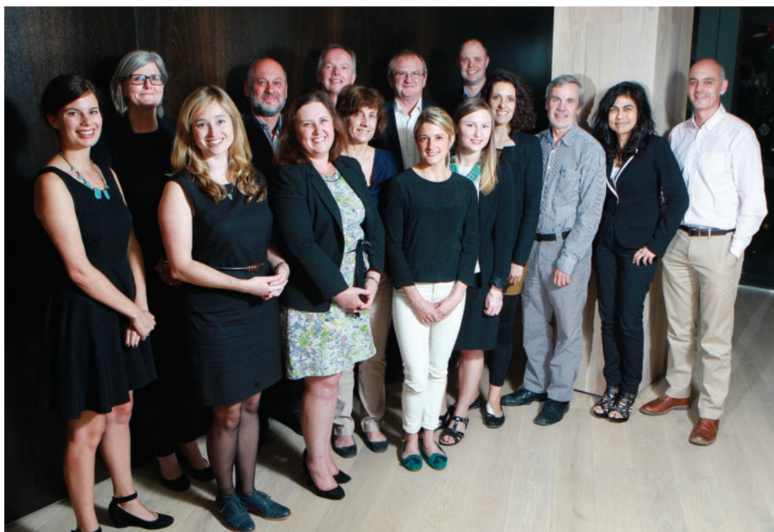
Climate Council Board members, Councillors and staff.