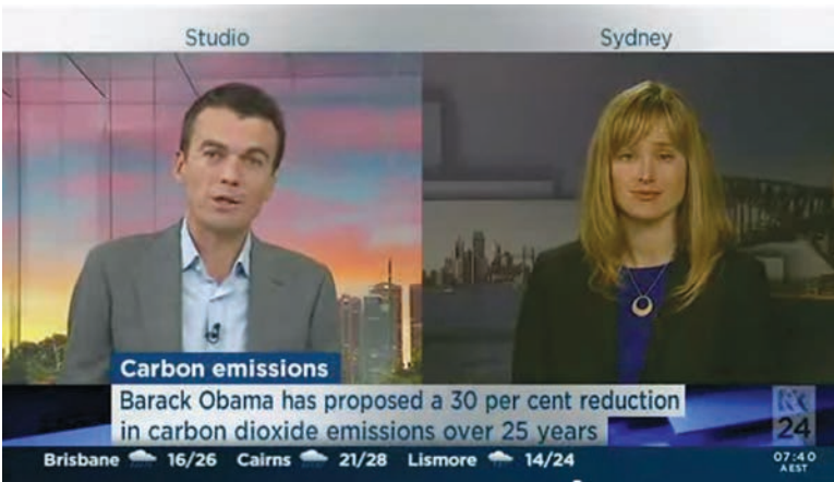
CEO Amanda McKenzie speaking on ABC's breakfast program about climate action in the USA.