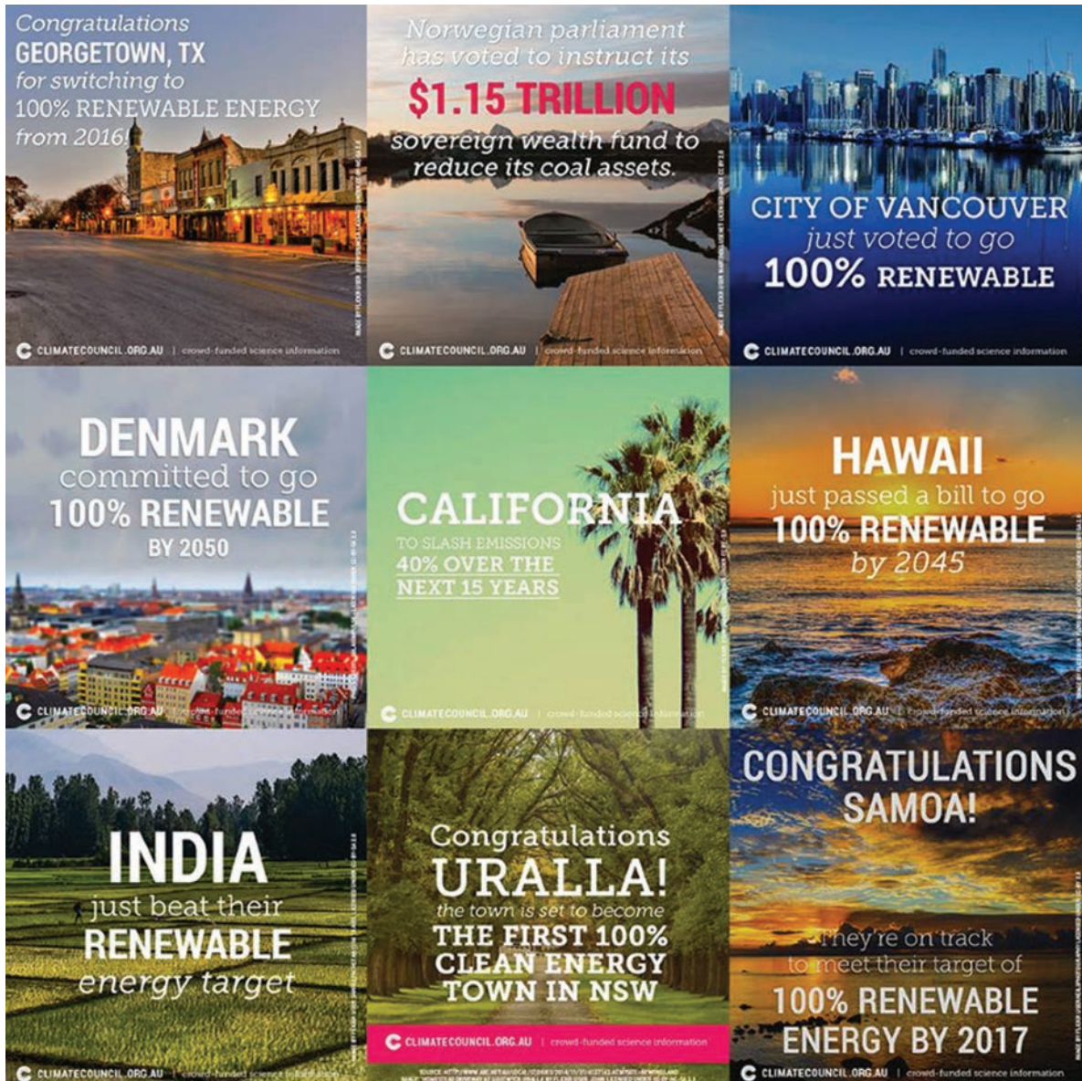
Examples of the Climate Council's positive focused social media content.

Having built a reputation for being a trusted and engaging voice in climate science communications, our partners feel confident in sharing the work we distribute.