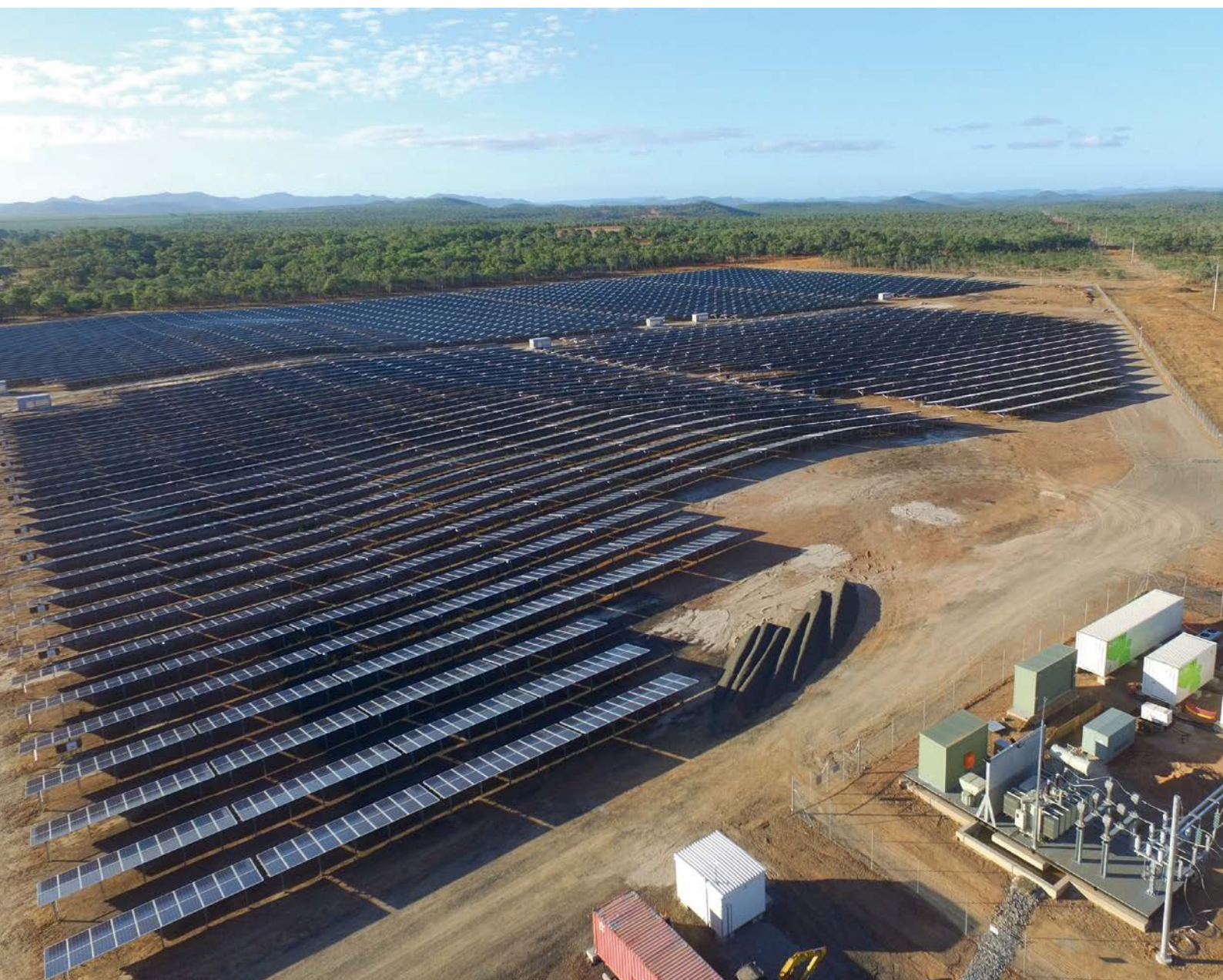
Figure 3: Lakeland solar and battery storage project.