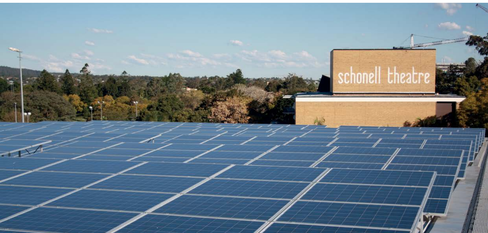
Figure 1: Rooftop solar at University of Queensland.

Queensland households with solar use 18% less electricity from the grid than the average residential user (ACCC 2017).