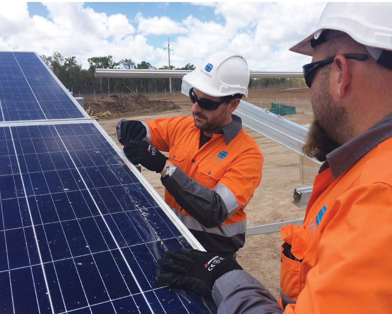
Figure 2: Lakeland Solar and Storage project under construction.

Other sources indicate even more large-scale renewable energy under construction in Queensland. Green Energy Markets (2017) reports 1,759MW under construction in Queensland in September 2017.